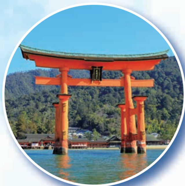
World Heritage Site Itsukushima Shrine