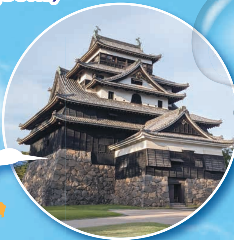
National Treasure Matsue Castle

"Let's Learn More About Enjoyable Oral Surgery Techniques!"