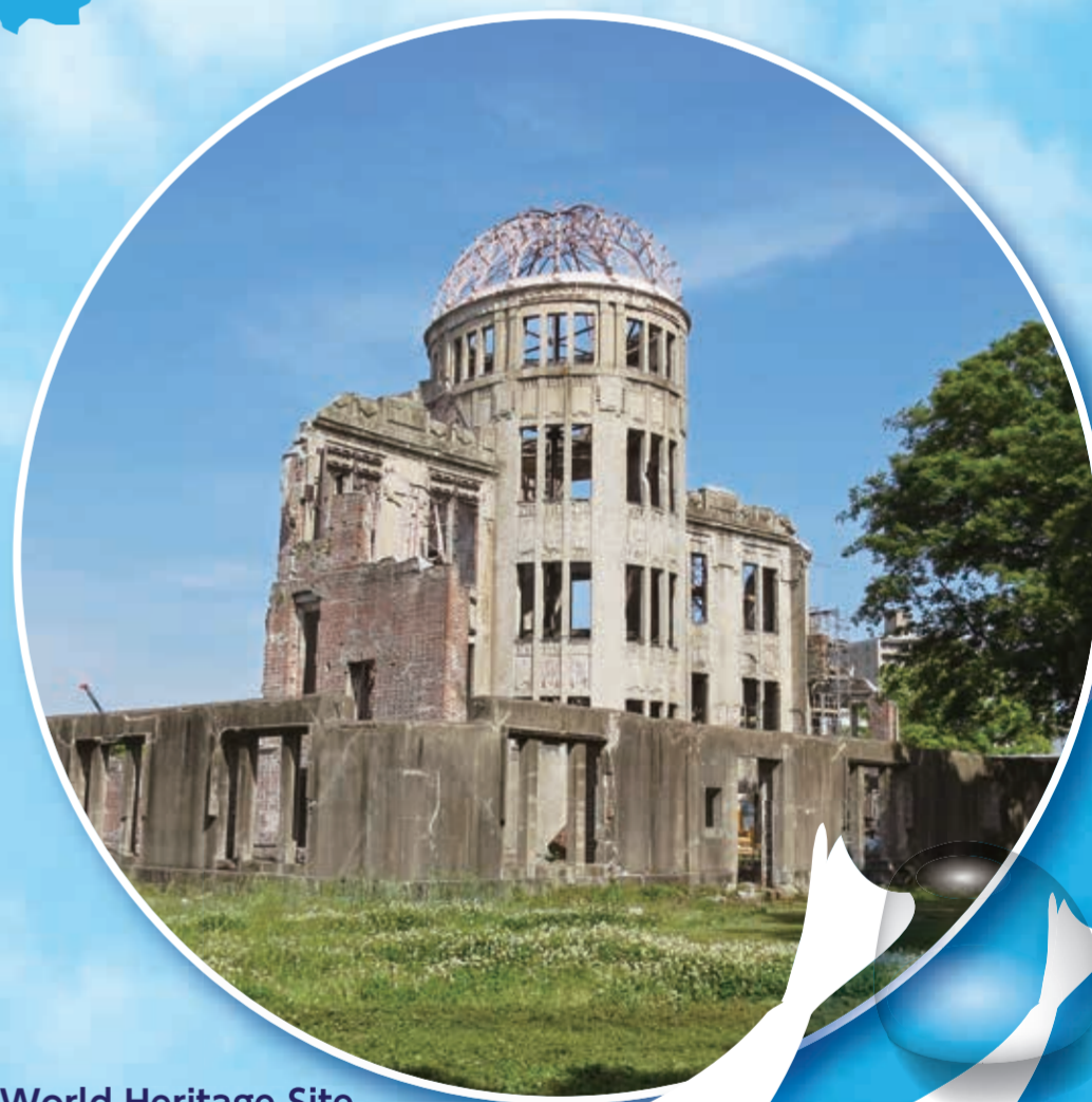
World Heritage Site Genbaku Dome